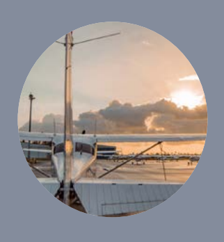
SAVE YOUR VALUABLE FUNDS

Adding the Night Rating to your Pilot License is an essential part of successfully becoming a professional pilot. Continue your journey to the sky by gaining all required ratings to join commercial airlines!