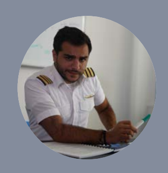
WHY GET THIS RATING?

You will begin all of your theoretical training from the comfort of your home. Afterwards, you shall come to the school to carry out the flight training portion of your course.