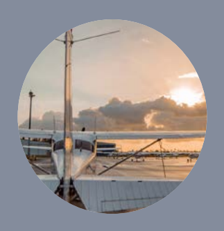
SAVE YOUR VALUABLE FUNDS

You can start with our discovery flight or directly enroll in our Private Pilot License course which is the first step into the world of aviation. Become a Pilot in no time with our PPL course and soar the skies for leisure.